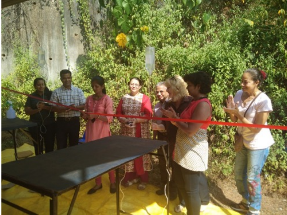
Inauguration of the Truck ABC program by the Sarpanch, Secretary, ward members and residents of the Curca Village Panchayat