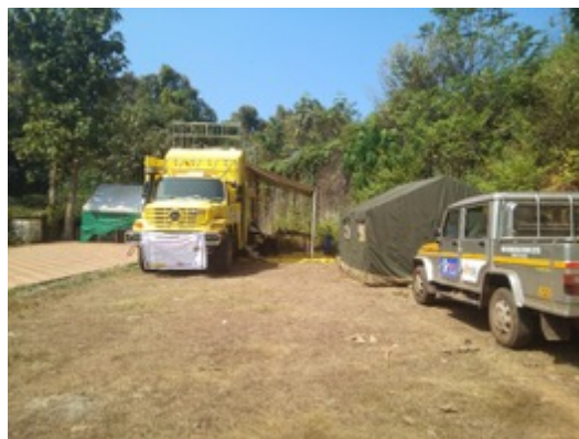
Parking the Truck at The St Anne Church compound